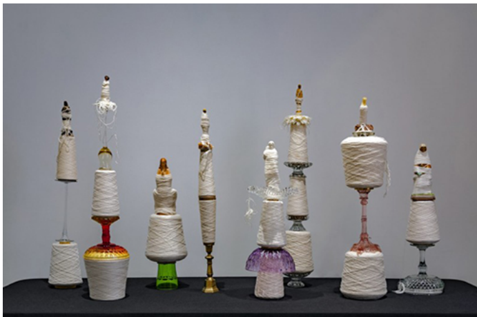
Erika DeFreitas, ( if you look closely she moves ), 2016, assemblages of thread spools, candle sticks, glass, wood, brass, stones, beeswax, vintage Mary sculptures

Some artists spend their careers doing one thing over and over again. Others have solo exhibitions that look like group shows. Neither method is necessarily better than the other, but the difference in their approaches indicates something about the priorities at play in their creative processes. The current two-person exhibition at Angell Gallery is a study in contrasts with one artist using a different medium for each piece to capture a wide variety of responses to a particular idea, while the other dedicates himself to a singular technique, returning again and again with slight variations to its specific challenges and evocations.